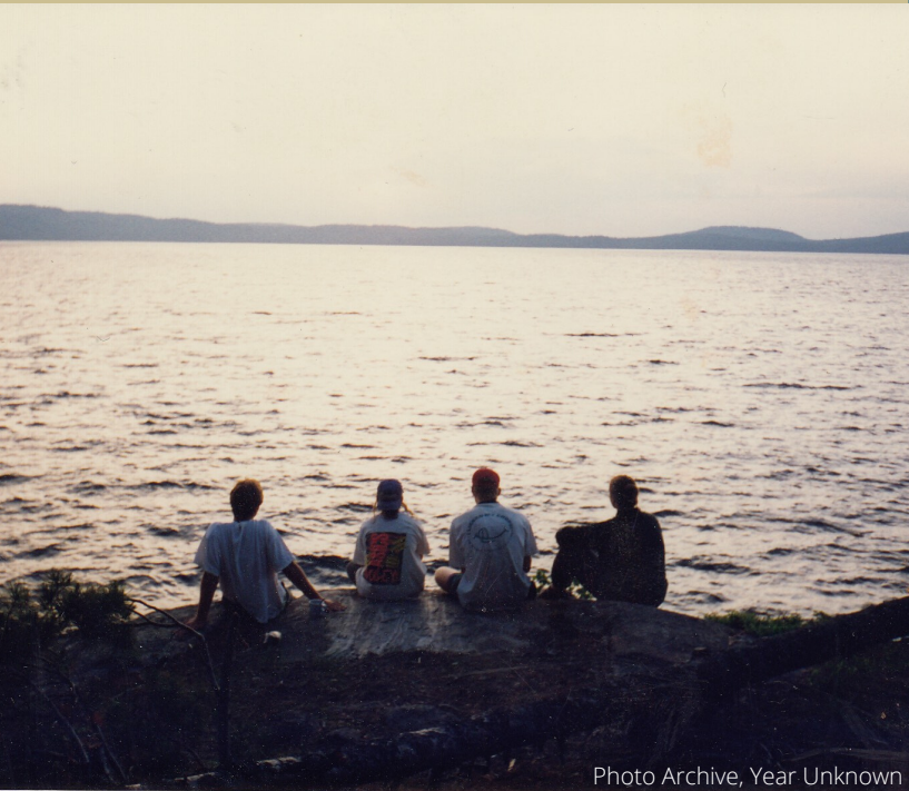
Photo Archive, Year Unknown