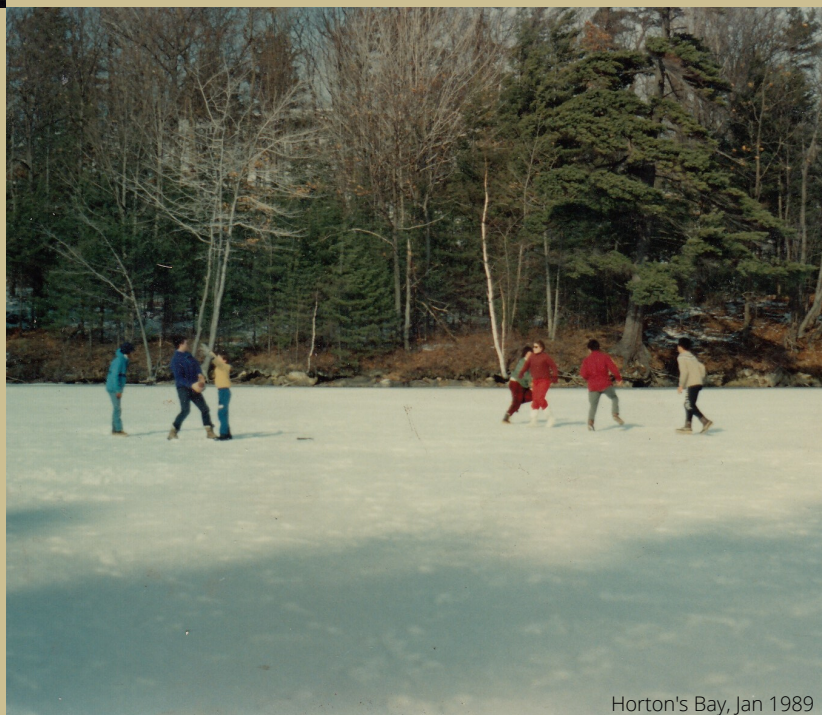
Horton's Bay, Jan 1989